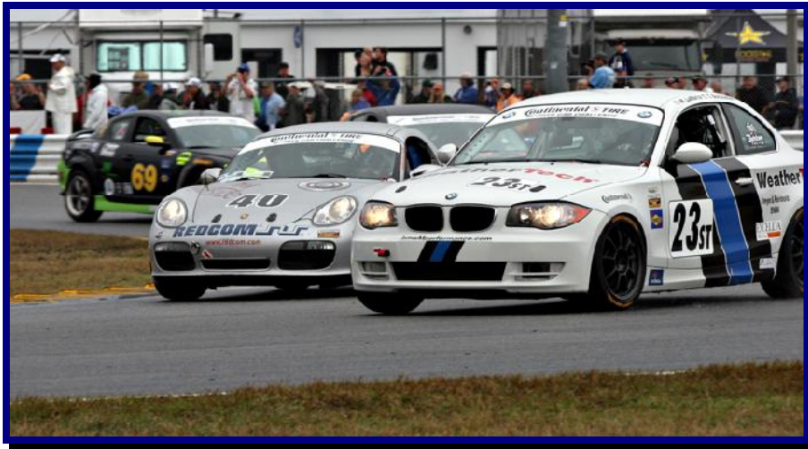
Photos from the BMW Performance 200 Continental Tire Sports Car Challenge are posted now on www.ashautophotos.com